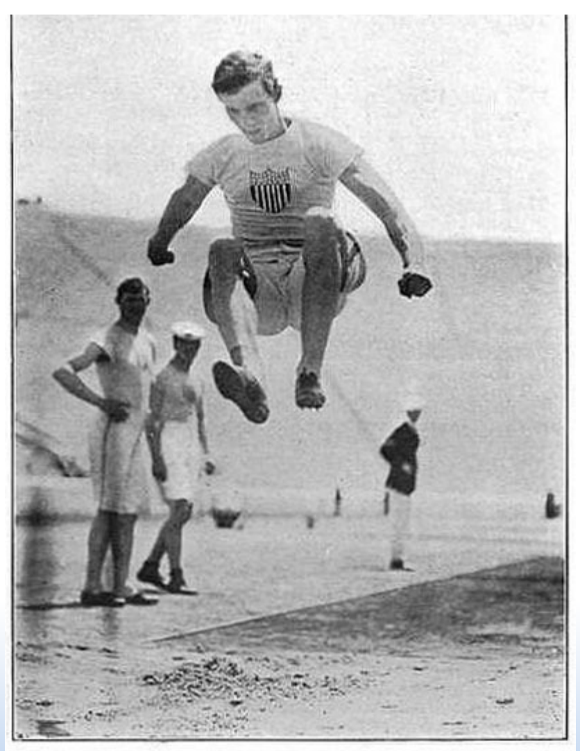
MYER PRINSTEIN, OF THE AMERICAN TEAM, WINNER OF THE RUNNING BROAD JUMP.