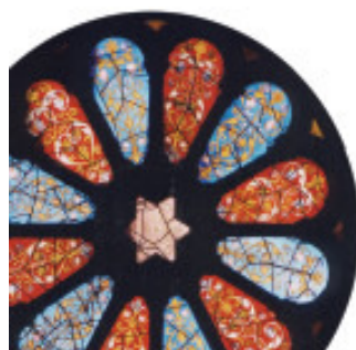
Image credits All © English Heritage except Glasgow © Crown Copyright RCAHMS. Photos from either Jewish Heritage in England: An Architectural Guide (English Heritage) or The Synagogues of Britain and Ireland (Yale University Press), both by Sharmen Kadish

The European Routes of Jewish Culture link landmark sites in an international Jewish Heritage Trail as part of the Council of Europe's cultural programme 'Europe – A Common Heritage'. This initiative is the result of the success of the European Days of Jewish Culture and Heritage launched by B'nai B'rith in Strasbourg in 1996 and in the UK in 2000 with assistance from the organisation that became Jewish Heritage UK in 2004. Jewish Heritage Days attract about 10,000 visitors in Britain and up to 200,000 across Europe annually.