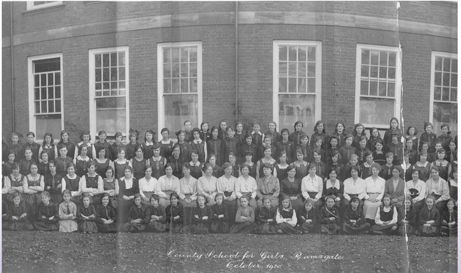
County School for Girls, Ramsgate. October, 1920.